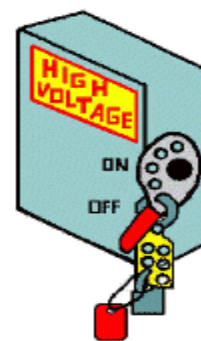
EXAMPLES OF COMMON LOCK AND TAG OUT DEVICES

Since January 2008, there have been 15 fires in classrooms or administrative buildings at 15 universities across the United States, resulting in one student death.