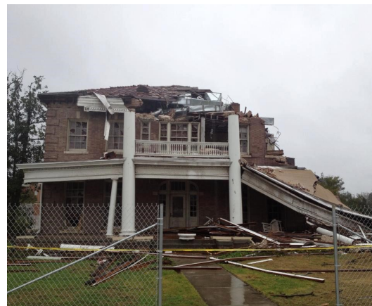
University of Southern Mississippi