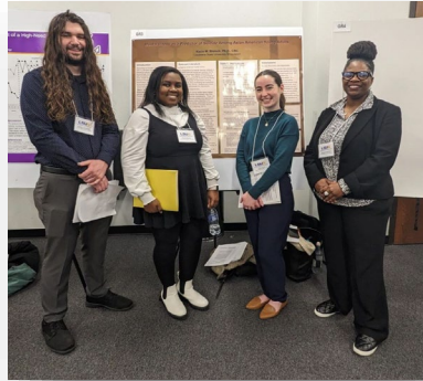
Scholarly Students: Above, LSUS MSC Rehabilitation students gather to present at the LSUS Student Scholars Forum.