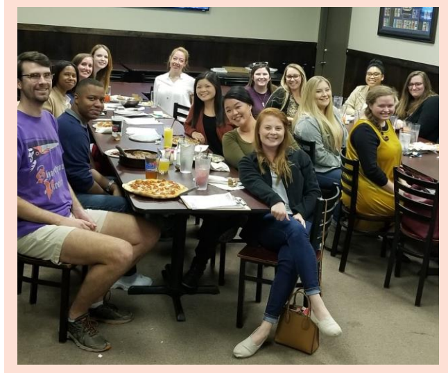
CSI welcomes first-year MSC graduate students at Rotolo's!

As the honor society for counseling professionals, CSI focuses on the importance of professional development, community engagement, and wellness advocacy.